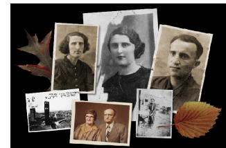
The Erwin and Riva Baker Memorial Collection